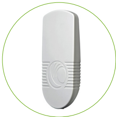
ePMP 1000 Integrated Radio