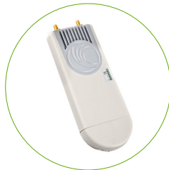
ePMP 1000 GPS Sync Radio