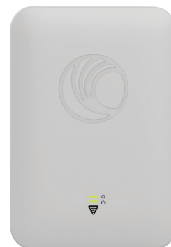
cnPilot E500, E501S

The E500 and E501 APs can be backhauled over Gigabit Ethernet for fiber or copper networks or can mesh with other E-series APs, or can be paired with Cambium's backhaul to rapidly deploy outdoor Wi-Fi.