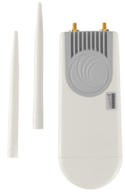
ePMP 1000 Hotspot

A highly affordable, yet proven, reliable, enterprise-grade connectorized outdoor hotspot that is perfect for public Wi-Fi, enterprise campus, or event coverage applications. This multi-purpose platform, combining high transmit power and external connectors, can run either as a controller-managed Wi-Fi AP or as an ePMP backhaul node combining application versatility and affordability in one compact form factor.