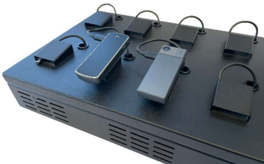
(Docking Station does not include cameras)